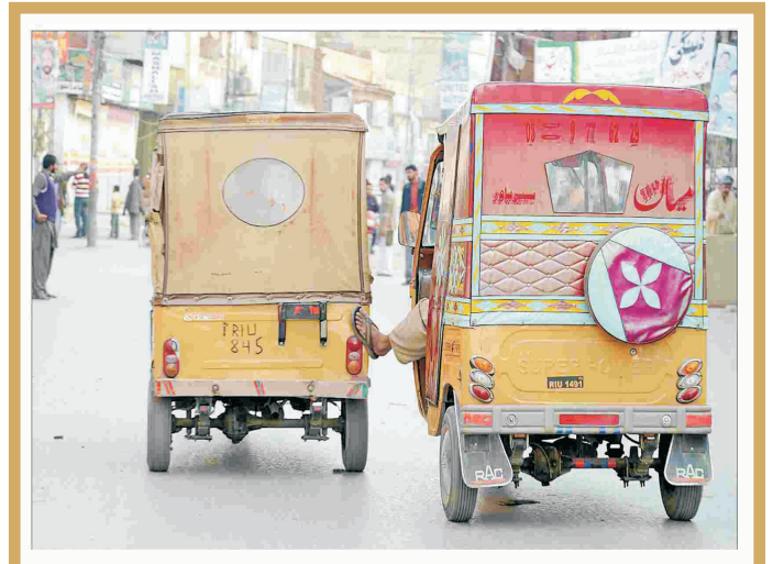
Lending a "helping foot": a rickshaw driver pushes another rickshaw to a shop for repair.

It was in the paediatric nephrology department that I was overcome with emotion as a mother of a young child sobbed, and another grasped her <u>Continued on page 5</u>