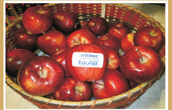
Adam's apples. Lunch for physicians, hosted by a pharmaceutical company.

For many doctors, the MR's visits are the only way they learn about new drugs. Indian doctors depend on the MR for information on new drugs, the indications, the dosages, why they are better than other similar drugs, and so on. Naturally, this information package is tailored to sell the drug, so the benefits are exaggerated, risks minimized and contraindications downplayed. The information given by MRs in India will likely be different from what is Continued on page 6